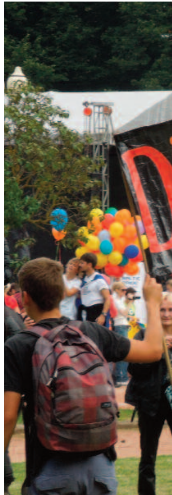
Above: Counter-protesters at the Baltic Pride in Vilnius, Lithuania, July 2013.

In order to effectively tackle hate crimes on the grounds of sexual orientation and gender identity, authorities need to make improvements in several areas. Currently, there are gaps in legislation in many EU countries, while investigations and prosecutions of crimes with a hate motive are often flawed. There is little support for victims, who in turn may be unwilling to report the crimes to the police, and impunity prevails for the attackers. This briefing identifies such areas with illustrative case studies. It also provides information on homophobic and transphobic hate crimes in these countries and makes a number of recommendations to both national authorities and the EU.