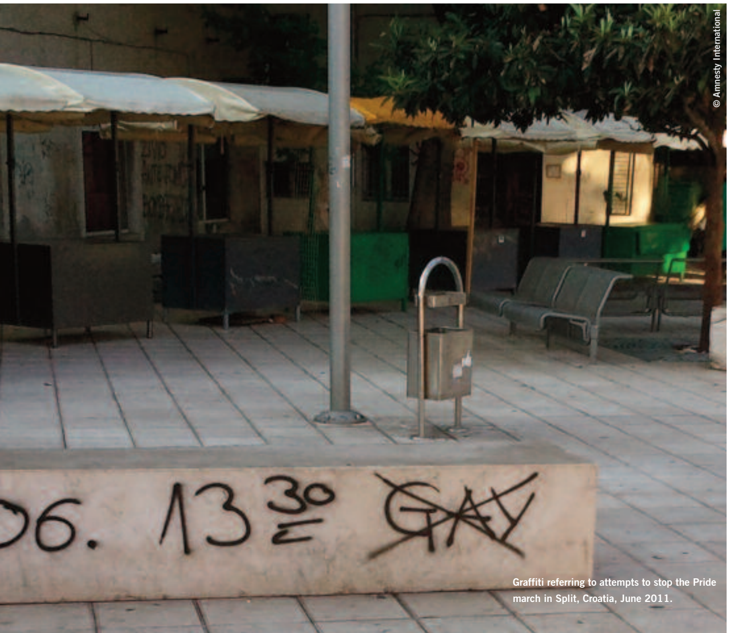
Graffiti referring to attempts to stop the Pride march in Split, Croatia, June 2011.