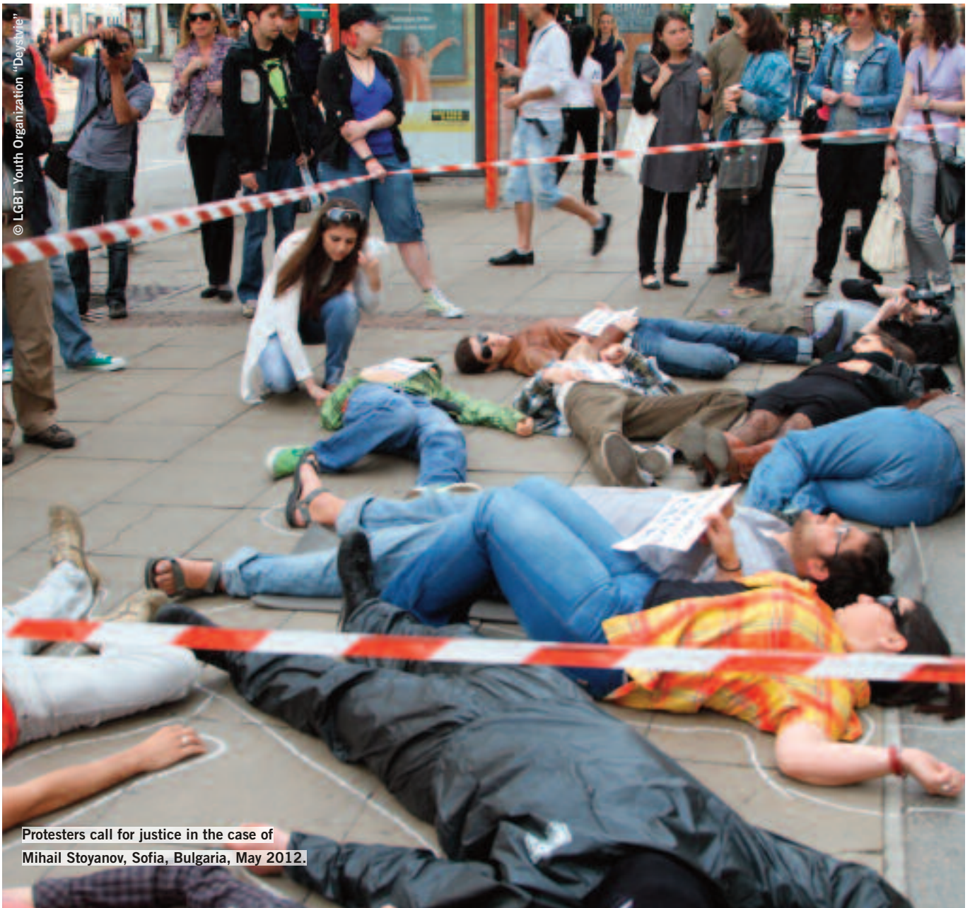
Protesters call for justice in the case of Mihail Stoyanov, Sofia, Bulgaria, May 2012.