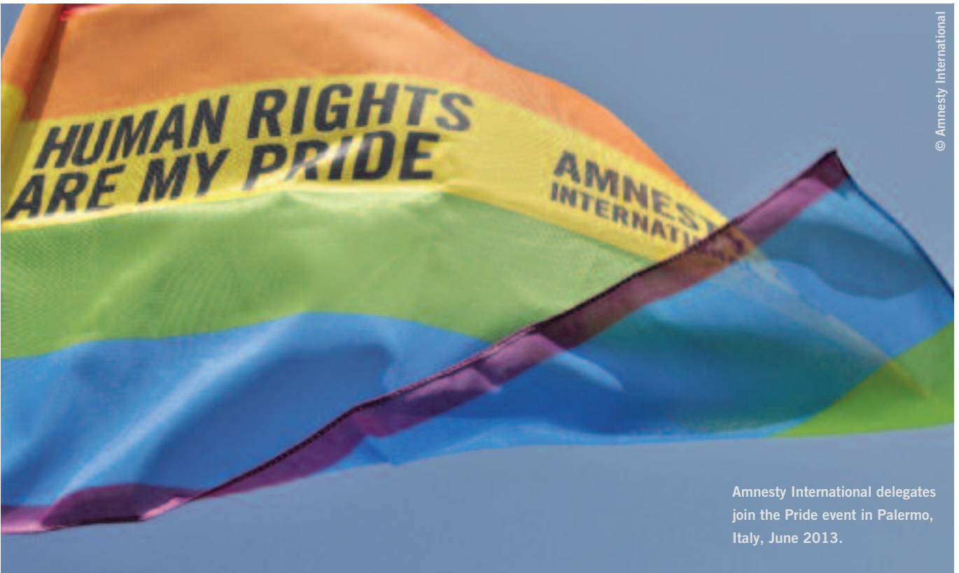
Amnesty International delegates join the Pride event in Palermo, Italy, June 2013.