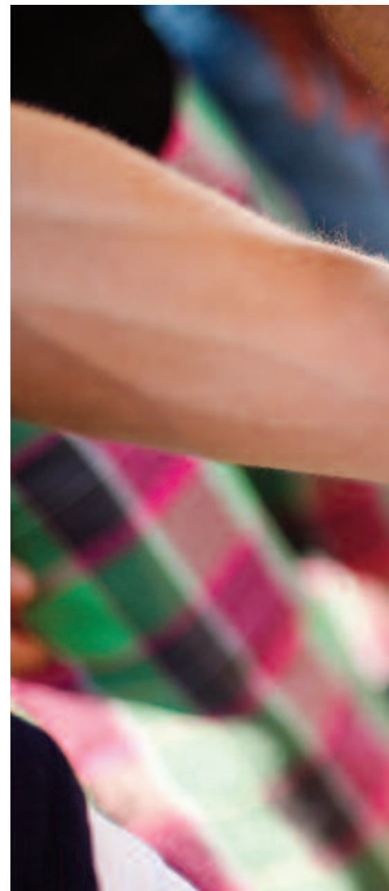
A gay couple hold hands during the annual gay Pride march in central Rome, Italy, June 2013.

In December 2011, as she was leaving a nightclub, she was approached by a man who made sexual advances. As she refused other men appeared and attacked her. “They punched and kicked me all over my body, when I fell onto the floor they kicked my head, they ... ripped